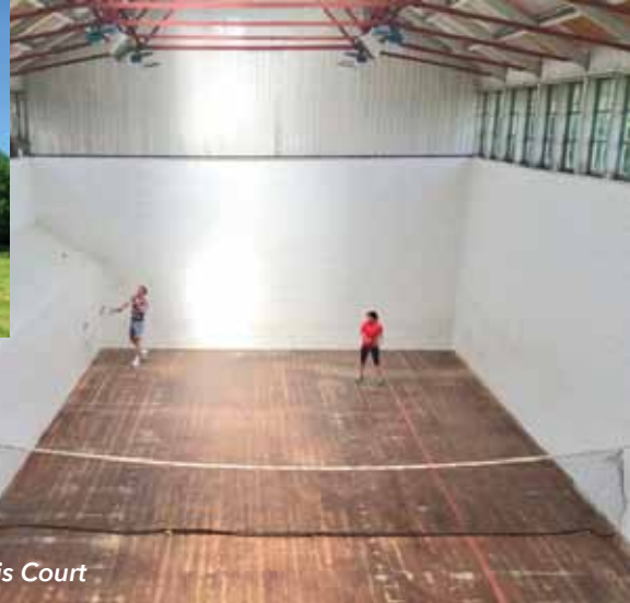
Stické Tennis Court