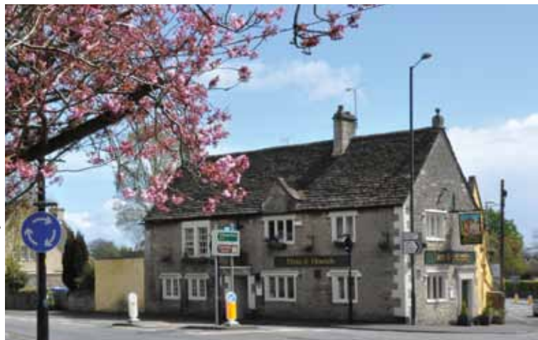
Hare & Hounds, Pickwick