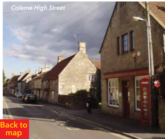
Colerne High Street