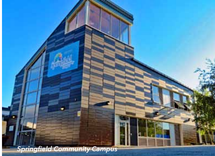
Springfield Community Campus