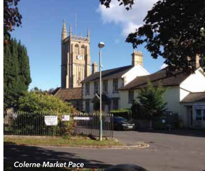
Colerne Market Place