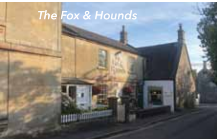
The Fox & Hounds